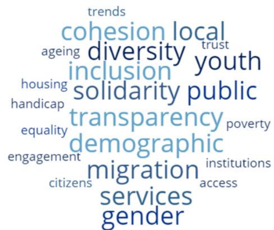
The word clouds in this document do not reflect CEMR's priorities for the multi-annual strategy. It only serves illustration purpose.

One of today's major challenges is digital technology and the impact that digital transition and technological innovation will have on the way we work, we communicate, we organise our day-to-day life. Local