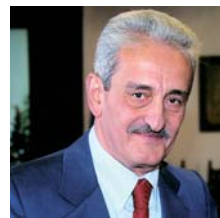
Hatjis Hatjiefthimiou Mayor of Rhodes

We look forward to welcoming you to Rhodes to demonstrate our common commitment.