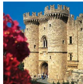
The Palace of the Grand Master will be the venue for the Closing Session.

Rhodes has managed to combine its history and multicultural character with contemporary infrastructure in the modern urban center to become one of the most important tourist and conference destinations in Greece, having hosted major events including the EU Summit in 1988.