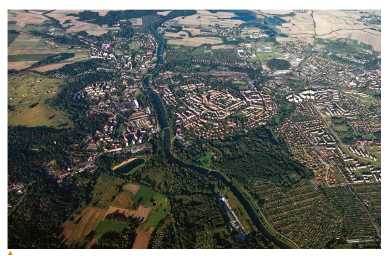
Nysa City, southwest Poland, population 47,000. In Poland, polycentrism has successfully established urban areas of different sizes within the national urban network.

From 1991 onwards, the EU had to review fundamentally its relations with European nations beyond its eastern boundaries. With the EU eastward expansion, the question arose of how to secure peace and stability at the EU's new periphery. Various policies came into being, including the European Neighbourhood Policy (ENP) and the European Security Strategy (2003).