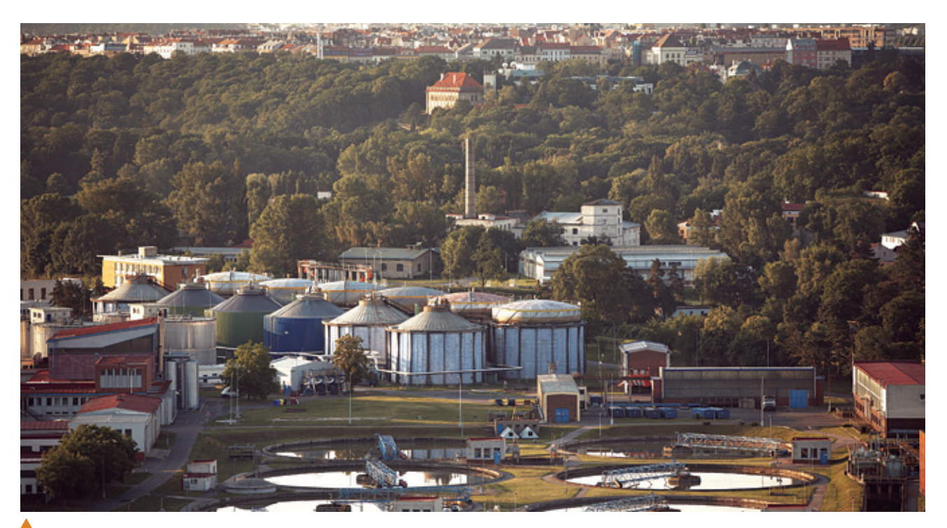
A water treatment plant in Prague, Czech Republic. The Czech Republic's water supply and wastewater treatment services are highly privatised.

consumption structures differ significantly from country to country. For instance, if Ukraine were to implement technically-possible improved standards, even though these are not the best available technologies, they could still lower overall energy losses to 38 per cent. Such savings would be critically important given Ukraine's dependency on imported natural gas.