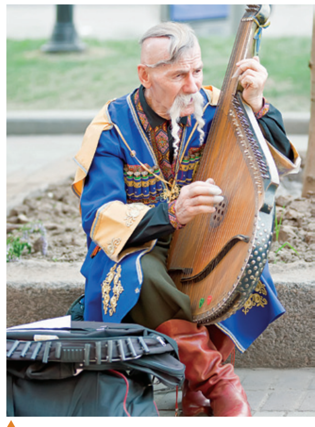
A Kobzar singing to his own accompaniment in Kiev. Demographic ageing has put pressure on Ukraine's economy.

However, it is important to understand that perceived urban shrinkage, especially where it concerns the larger cities, is to some extent a matter of definition rather than an urban population issue per se . Whereas population data based on cities' administrative area (the municipality or the city proper)