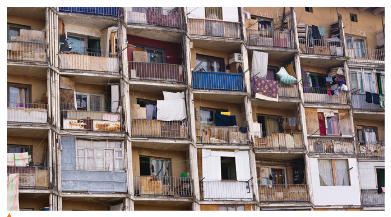
Tbilisi, Georgia. An example of the proliferation of 'vertical slums' across the region's cities.

There is a need to increase the supply of affordable urban rental housing throughout the region rapidly. Better articulated regional development policies could contribute to geographically-improved housing distribution with new or renewed policies and programmes for the social housing quantities in each country. In addition, well-functioning housing markets require responsive land markets but urban land supply is often problematic. Large tracks of urban land have unclear ownership while others are heavily polluted or have been abandoned.