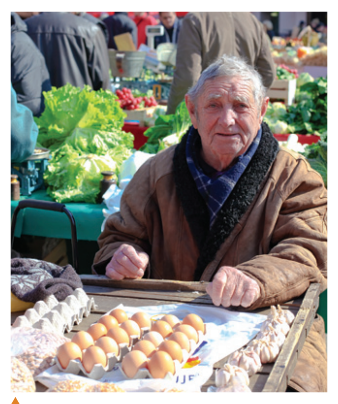
Zagreb, Croatia.

Throughout the region, rural dwellers are generally poorer than urban ones. However, as explicitly noted in the case of Albania and Romania, extreme poverty associated with social