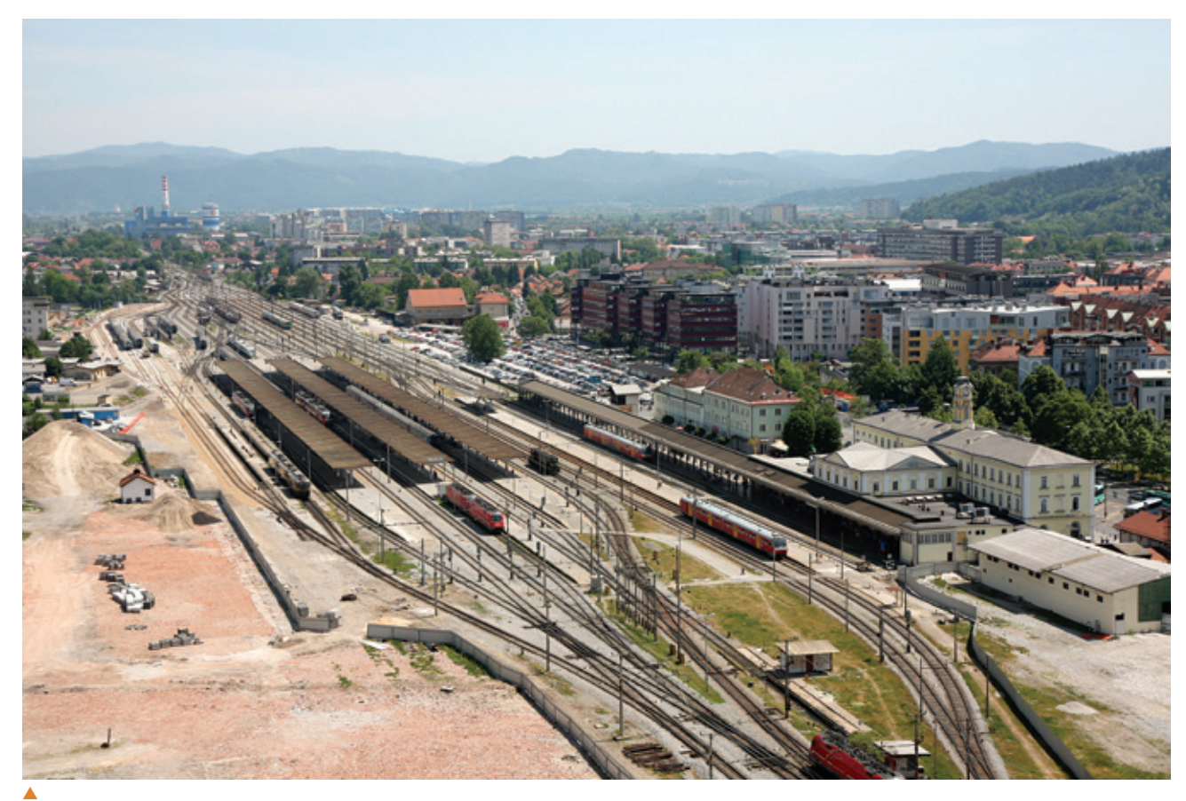
Ljubljana, capital of Slovenia. The international role of cities is mostly determined by their connection to major transport corridors.

The South Caucasus, once famous for its ethnic and cultural mosaic, has rapidly become a place of 'titular' ethnicities as minority groups lost population and became quite isolated and excluded from mainstream political and socio-economic processes. However, countries' ambition of significantly increasing their economic potential and attractiveness, as well as the intention of converting their cities in regional hubs and growth poles, will require more tolerance and acceptance of cultural diversity and otherness. This should be considered by policy-makers when determining national and local strategies of urban development.