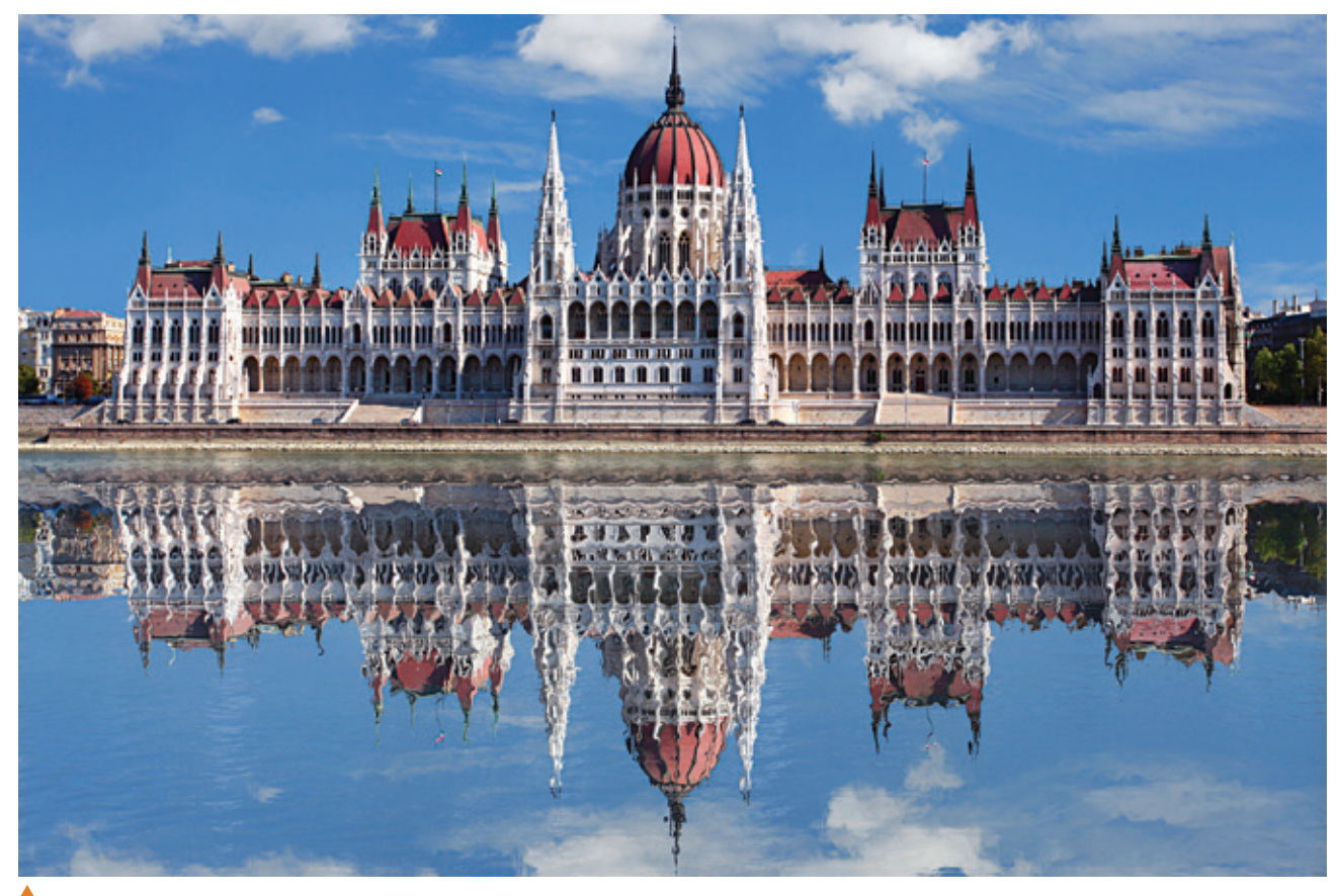
The parliament building in Budapest, Hungary. All transitional countries have made progress in their transformation from Socialist centrally-planned economies to democratic and market-based systems.

Clustering (networking) of municipalities is a clear and desirable possibility in most countries, with some initial steps