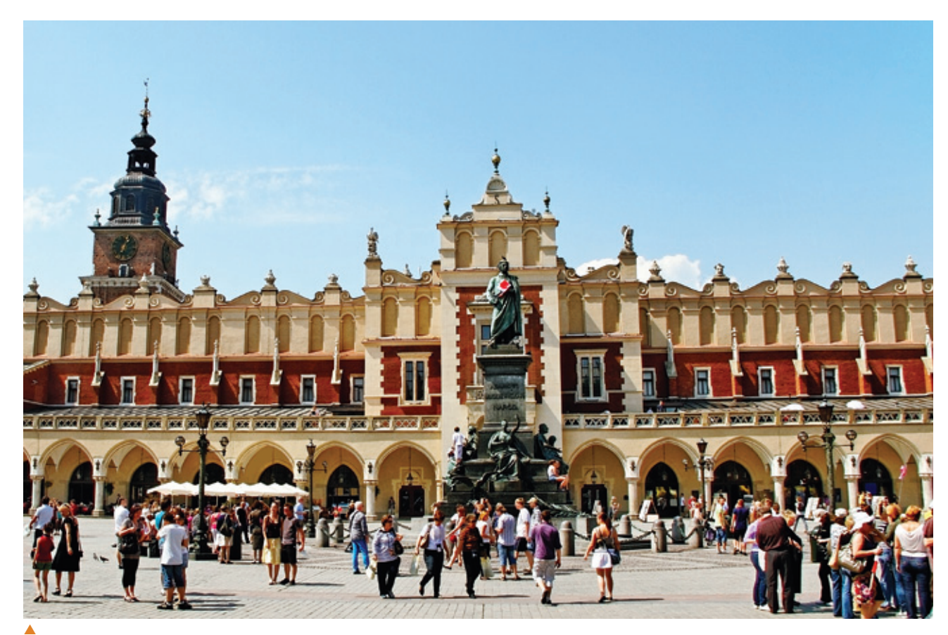
The Renaissance Sukiennice (Cloth Hall) in Krakow, Poland, is one of the city's most recognizable icons and a huge tourist attraction.